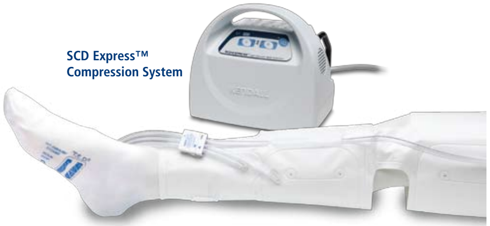
SCD Express™ Compression System

Visit us at our Booth #13 and see what's evolving at Covidien