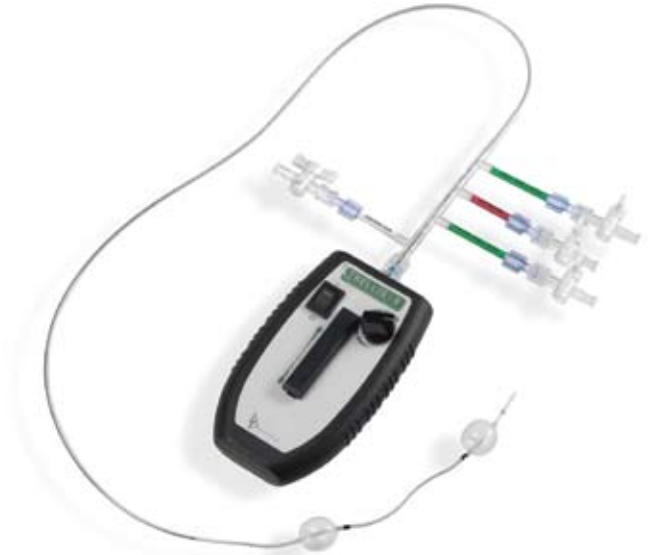
Trellis™-8 Peripheral Infusion System

Visit us at our Booth #13 and see what's evolving at Covidien